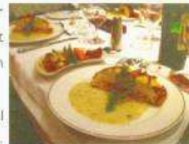
A typical Gourmet meal presentation

You can also Wine and Dine whilst you cruise down the River Ouse in York and attend the Hog Roast and Barn Dance and the excellent Variety Evening at Middlesborough.